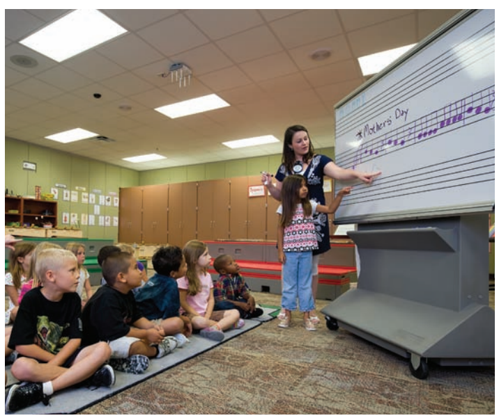
FOOTNOTES® MUSIC RUG, LESSONWORKS® AND FLIPFORMS®

When her students recently performed a musical called 'Bugz!' some picture-props – including a giant soda bottle and an apple -- were taped to music stands onstage. "Adjusting the stands to various heights helped the pictures really pop from the stage," recalls Hausmann. "It was really cute." Her students also used flipFORMS onstage as risers for this musical.